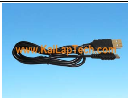
Соединительный USB-кабель Деталь No. KLT-USB6A-Cable

Удлинитель кабеля USB. Продано отдельно.